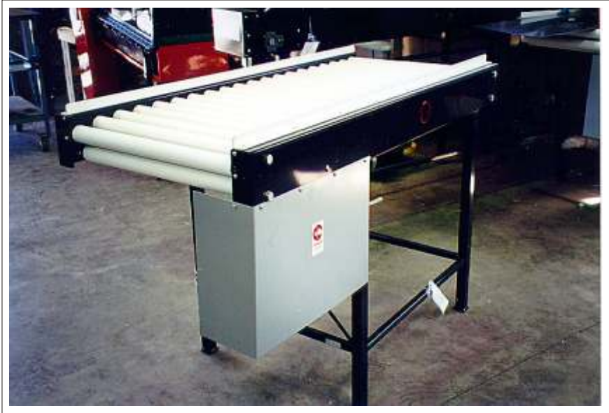
Photographed With Optional Divider For Second Line