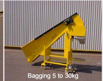
Bagging 5 to 30kg

Washing machinery is part of a comprehensive range of quality vegetable handling equipment from Tong Peal Engineering