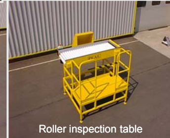
Roller inspection table