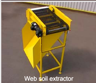
Web soil extractor