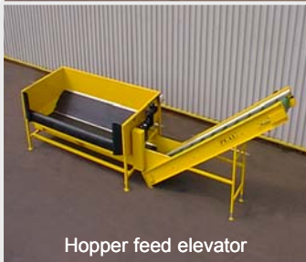
Hopper feed elevator