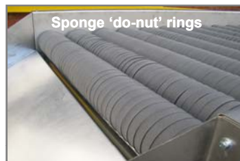
Sponge 'do-nut' rings