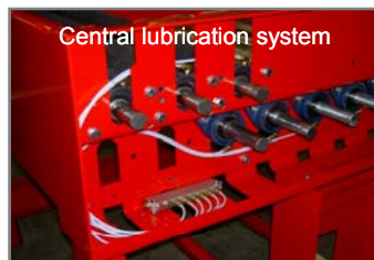
Central lubrication system