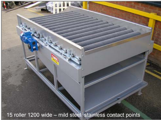
15 roller 1200 wide – mild steel, stainless contact points