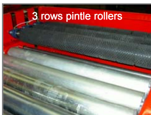
3 rows pintle rollers