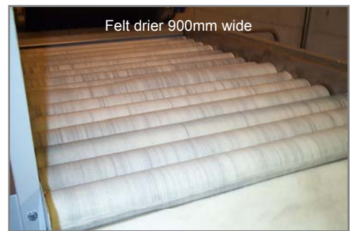
Felt drier 900mm wide

Stainless steel or mild steel with stainless contact points Long lasting sponge segment rollers or felt material