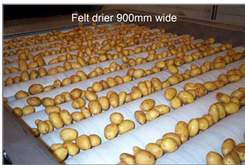
Felt drier 900mm wide

Stainless steel or mild steel with stainless contact points Long lasting sponge segment rollers or felt material